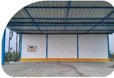
Cultural stage construction at Chotolanglai playground