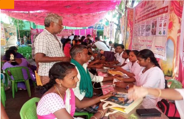
Medical Camp at Asthinapuram village.