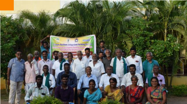
IFS training at KVK