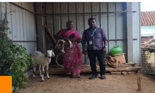
Beneficiary with newly purchased goat