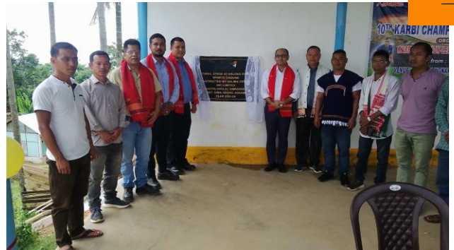
Inauguration of cultural stage