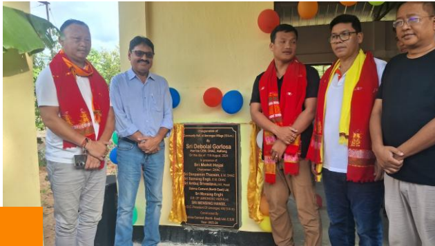
Inauguration of community hall