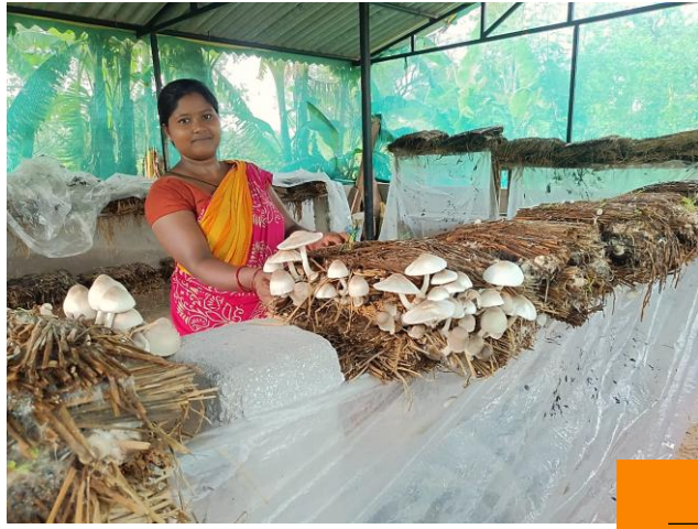
Saheli Gram Parivartan SHG Association

Each household is expected to earn an annual income of ₹50,000.