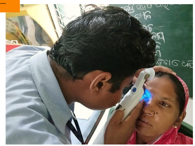
Eye Care Services