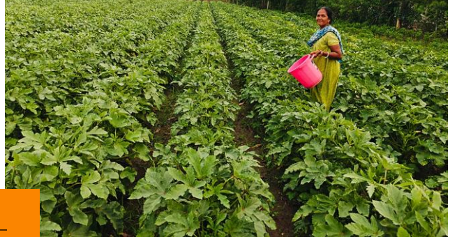
Kitchen Garden and Vegetable Cultivation