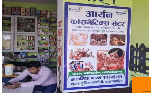
Battery Power Sprayer Support