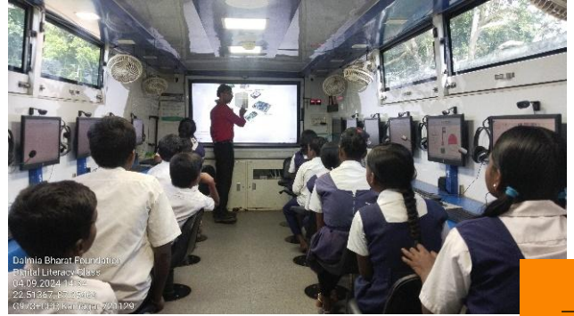
Dalmia Bharat Foundation Digital Literacy Class 04.09.2024 11:50 22.51.367.8888115 09830213441/983021129