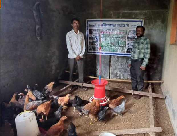
Backyard Poultry Birds

Distributed poultry chicks to farmers in Majgaon, Sontali, Darewadi, Khotwadi, Shindewadi, K Thane, and Satarde villages to promote local poultry farming. This initiative aims to enhance food security and support rural livelihoods.