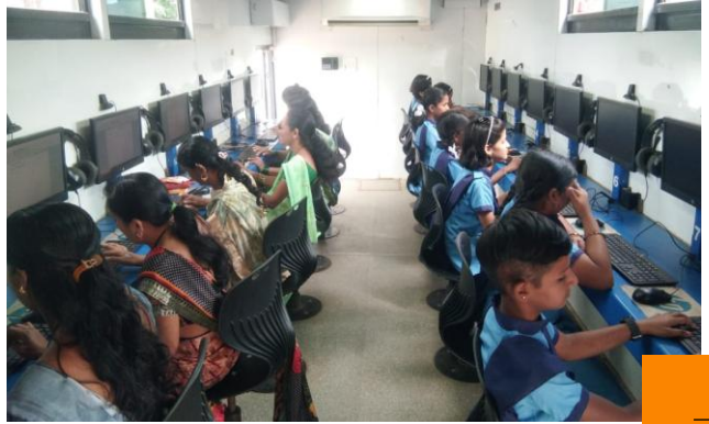
Swachhta Hi Sewa Campaign