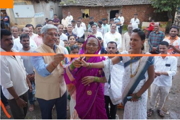
Drinking Water Plant

Inaugurated a safe drinking water plant in Khotwadi village to provide residents with access to clean and safe water. This initiative aims to improve public health and enhance the quality of life for the community.