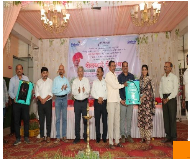
Agricultural power spray pump