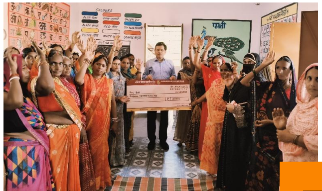
Saheli Gram Parivartan SHG Association