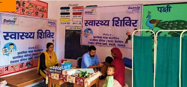
General Health Camp

Doctors from Dalmia Occupational Health Centre provided consultations, and free medical supplies were distributed to the children.