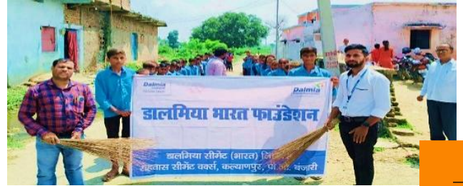
Swachhta Hi Sewa Campaign

Students cleaned the school premises and surrounding areas, encouraging students to adopt hygienic practices and emphasized the importance of cleanliness in daily life.