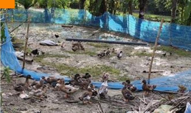
Duck Rearing Units