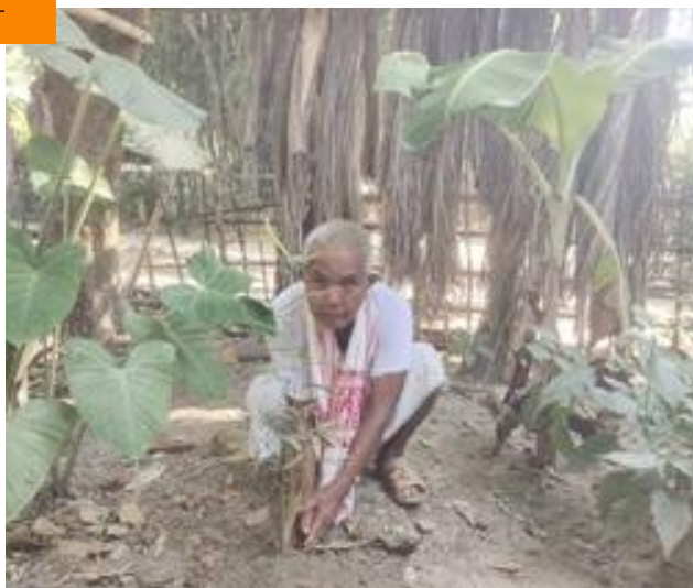
Bamboo Plantation drive