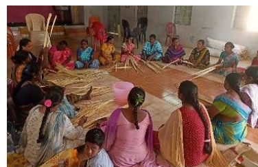
Palm Leaf Product Making Training