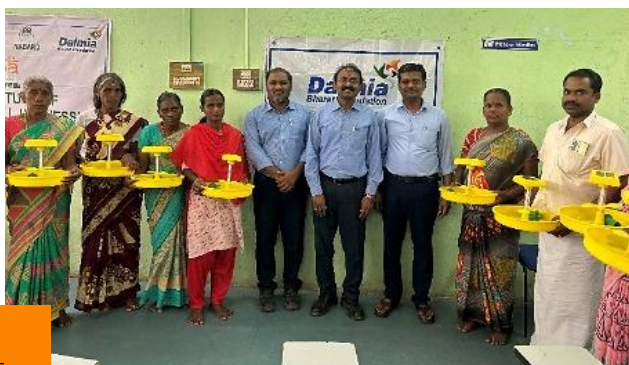
Solar Light Trap Support