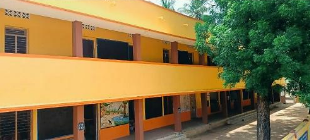
Eye Care Services

We provided assistance to the government-aided St. Mary's Middle School in Vadugarpettai for the purchase of painting materials, giving the school a refreshed look and bringing joy to the children.