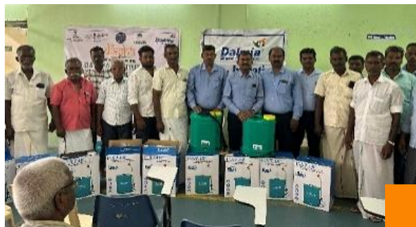
Battery Power Sprayer Support