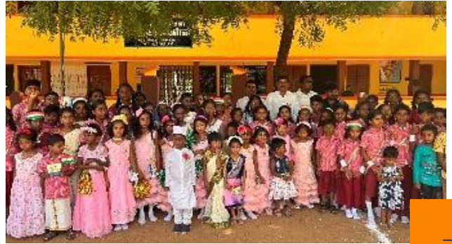
Celebration Of Independence Day