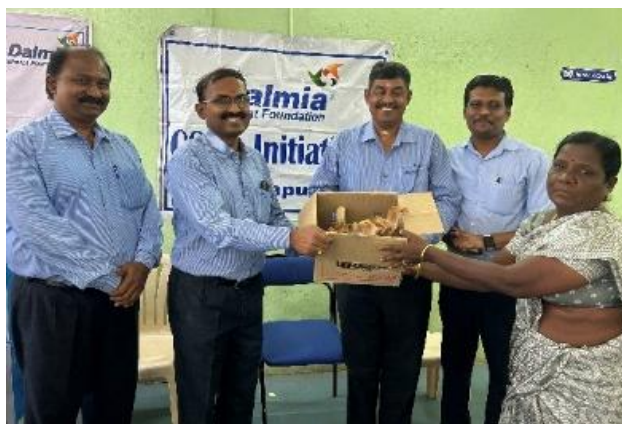
Country Chick Support