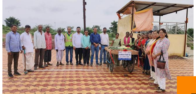
Handcart Support For Vegetable Business