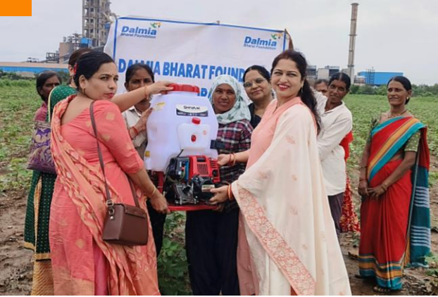
Power Spray Pump Distribution