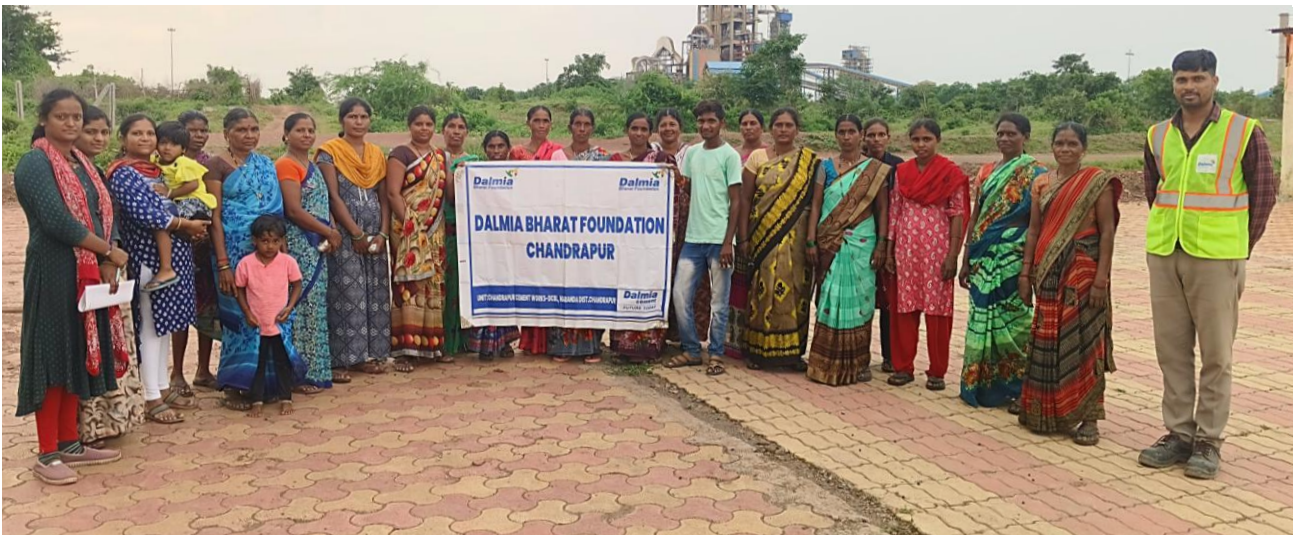
Drumstick Seed Distribution