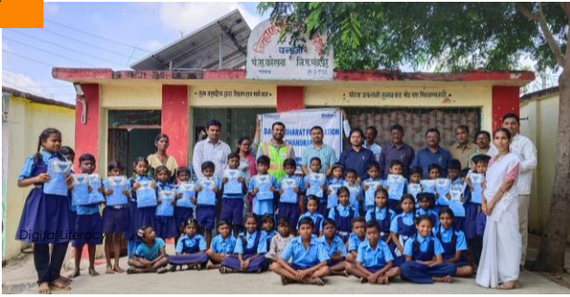
School Uniform Distribution

On Independence Day, school uniforms were distributed to 45 students from 1st to 4th grade at Z.P. School Vanoja , supporting their educational needs.