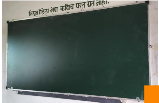
Green Board Distribution To School

In response to renovation efforts, six green boards were provided to Adarsh Kisan Vidyalaya & Jr. College in Naranda , benefiting 540 students by enhancing their classroom environment.