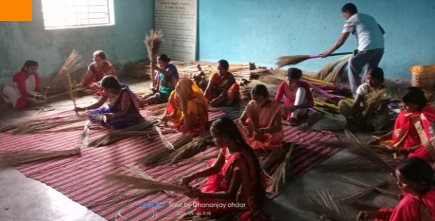
Broom Making Training