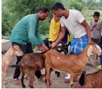
Vaccination And Deworming Of Goats

A vaccination and deworming camp for goats was organized in collaboration with the State Animal Husbandry Department.