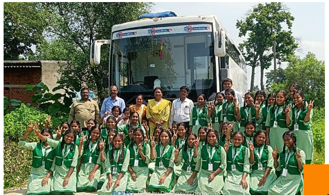
Digital Literacy through WoW Bus

A new batch of 200 students has commenced at Kasturba Gandhi Balika Vidyalaya, Jaridih , with students from Class 9 to Class 12 enrolled in computer literacy programs through the WoW Bus initiative.