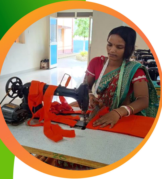
Tribal woman engaged in mat-craft project