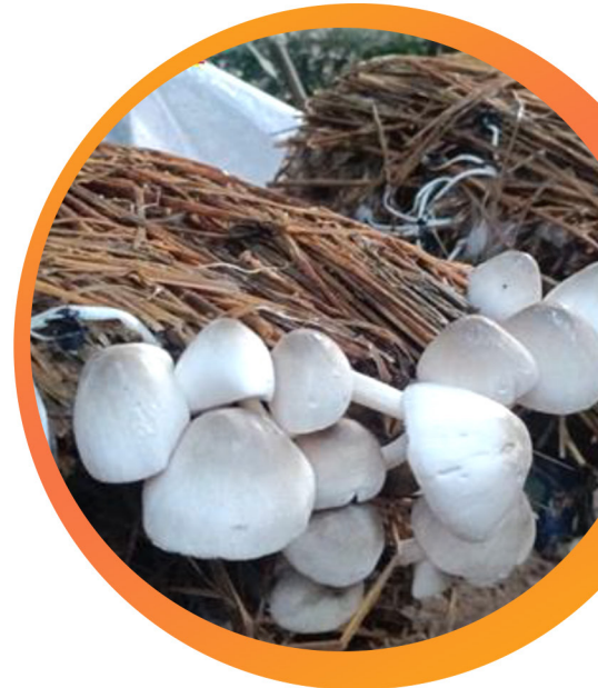
Paddy straw mushroom