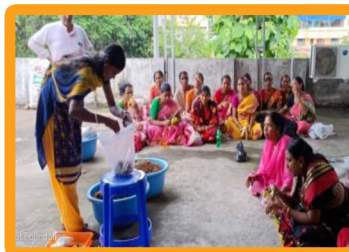
Women getting trained to produce Oyster Mushroom