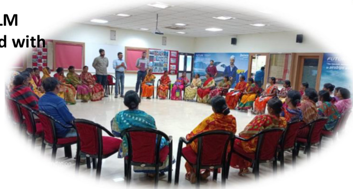
Producer group mobilization