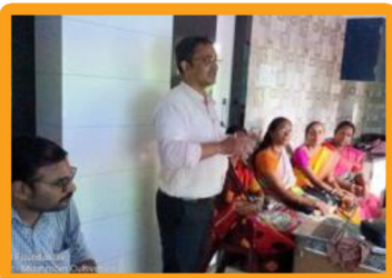
Organic mushroom cultivation training