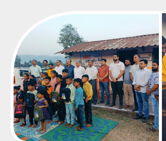
Educational Materials distributed to the children of H&T laborers