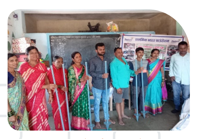
Inauguration of Garment Shop