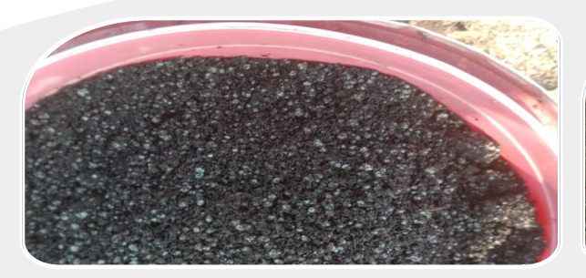
Vermi compost manure