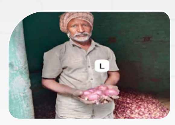
High Value Onion Production