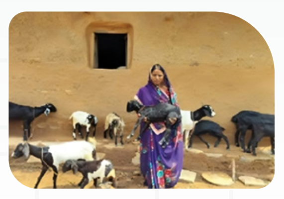
Goat Rearing & Azolla Unit