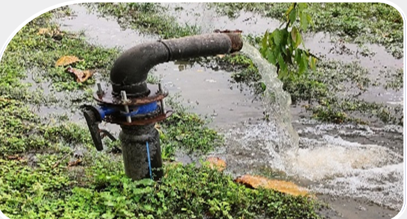
Excess Water Supply