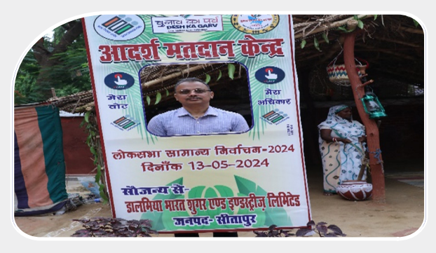
Selfie by Plant Head