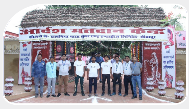
Group Photo Model Polling Booth