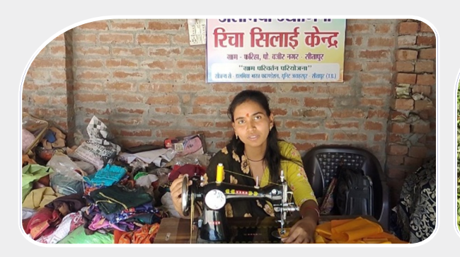
Stitching Center beneficiary