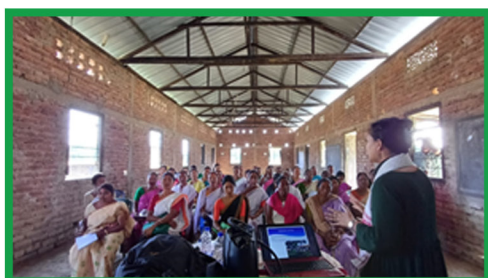
Training for kitchen garden in collaboration with KVK