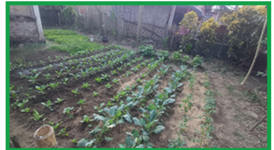
A backyard kitchen garden established in Kasarigaon village