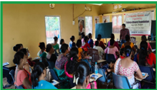
Duck-rearing training for women