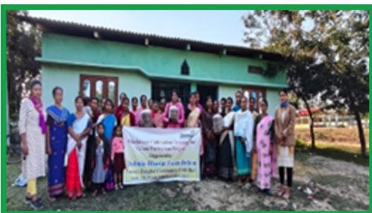
Women trained to produce mushroom in Jagiroad location