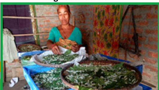
An Eri Rearing beneficiary working in her unit