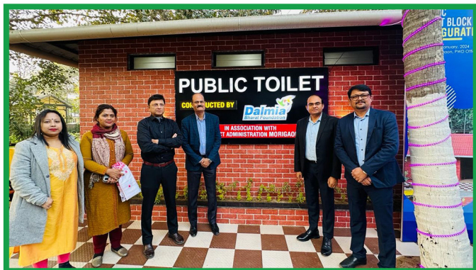
Public toilet work completed at Morigaon town