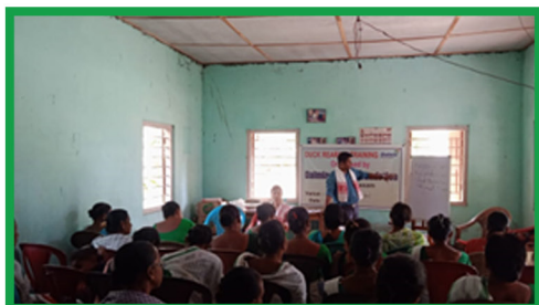
Training for duck rearing