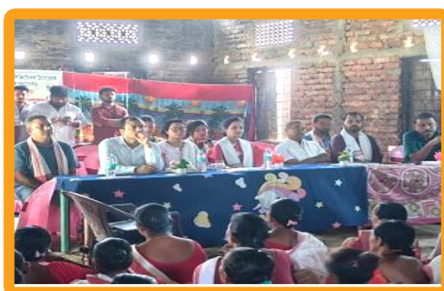
Dairy and Fishery farming awareness camp conducted for 300 women. Multiple Govt. Departments participated in this event organized by SRLM and DBF