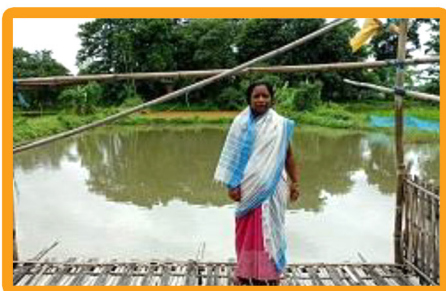
DBF team established Fish Farming at Junbeel village through linkages with Eco NGO