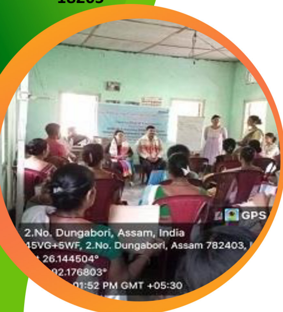
Goat rearing training at Natun Bonagbori village