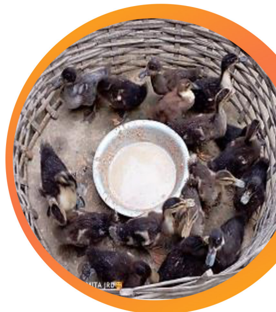
Duck rearing unit at Natun Bonagbori village