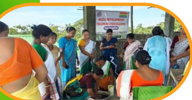
Women trained to make Agarbatti at Bhakatgaon Kachari village