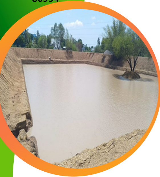
4672cum Water Storage structure in Arokiapuram