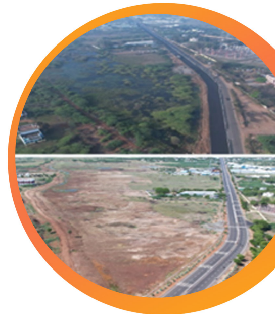
Water Storage structure in Pirattiyur