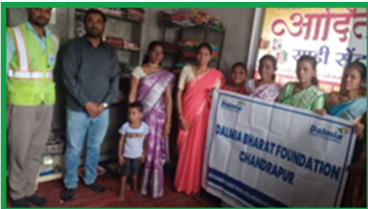
SHG group members involved in clothe selling