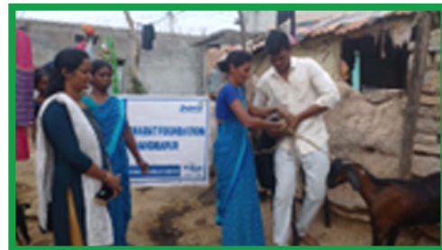
Vaccinations done for goats and members of Pashushakti