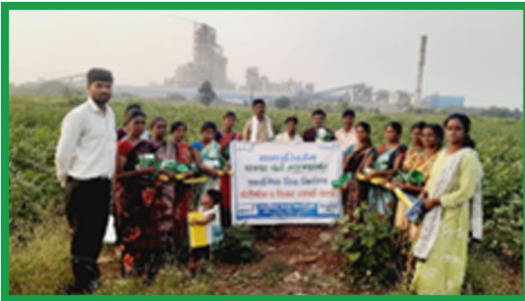
Yellow & blue sticky trap distribution to farmers on farm by DBF team