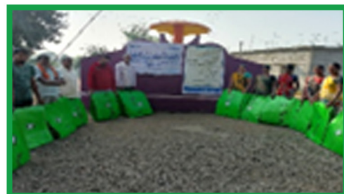
Beneficiaries with beds for production of Vermicompost manure