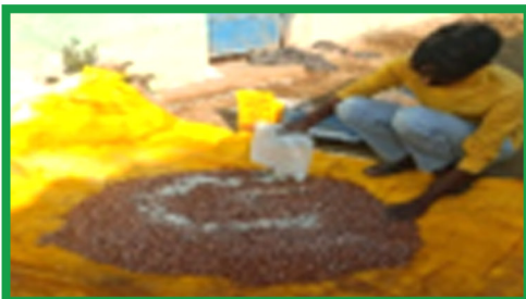
Bengalgram seeds getting enriched as part of seed treatment