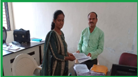
Convergence: Application to get subsidy for Goats submission to veterinary department