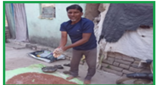
A beneficiary treating Bengal gram seeds using Rhizobium culture