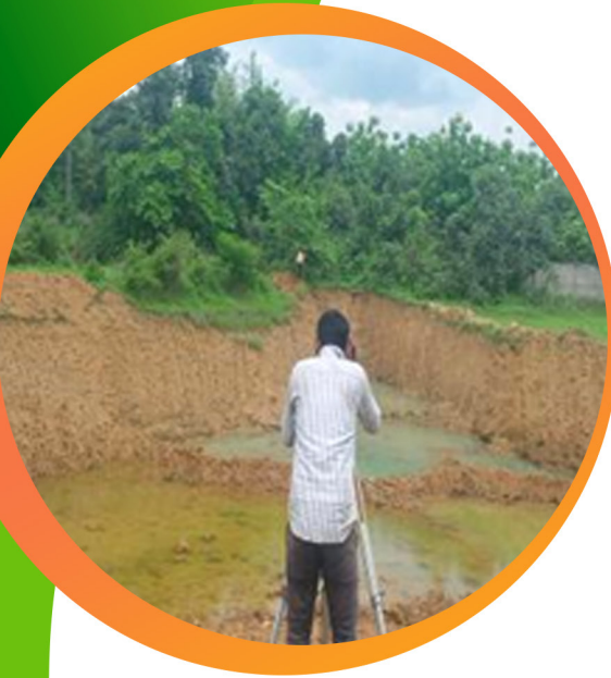
Village pond construction area mapped by surveyor after excavation