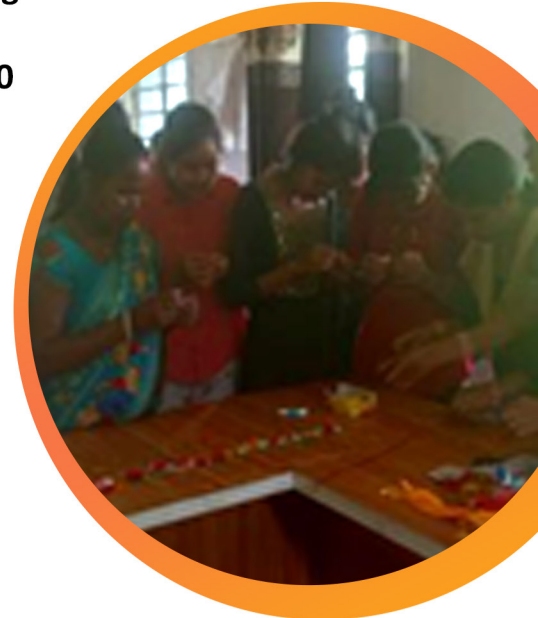
Beneficiaries getting Rakhi Training