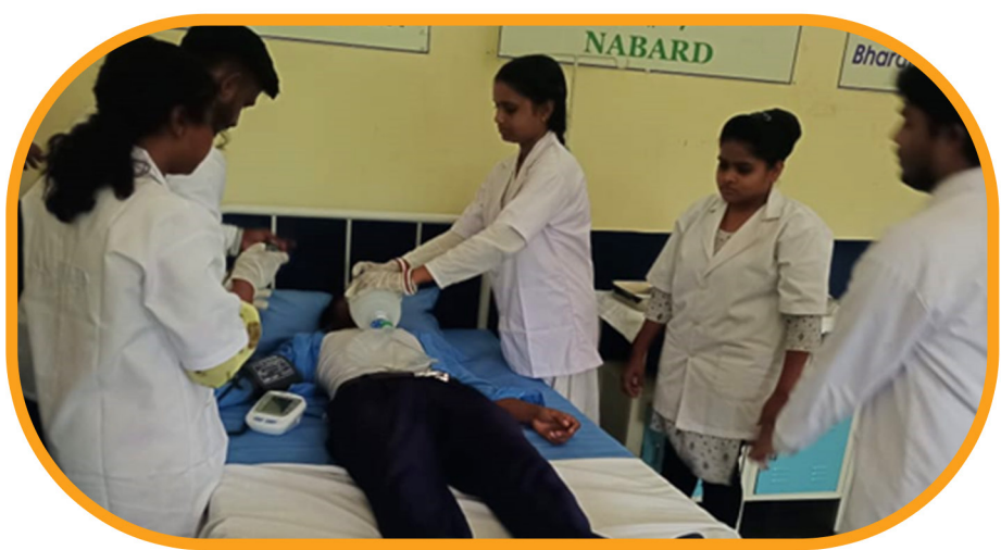
Trainees of General Duty Assistant trade learning new skills in the GDA Lab