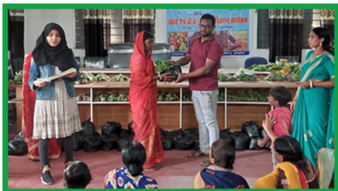
Vegetable Seed, Sapling and Vermi compost distribution at Gorabali