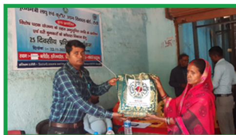
Carpet making training kit distribution